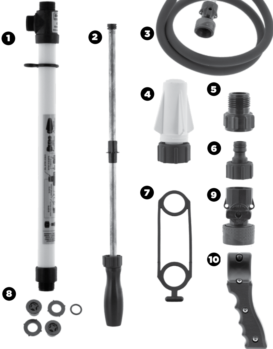
1 F-PUMPCHMBRASSMYEL 2 F-PISTRODASSMB 3 4062 4 4004-YF 5 F-SLEEVECHKVLVCART 6 4066 7 F-STRAPHANDLERRETAIN 8 4000SERV-CC 9 4063 10 4777