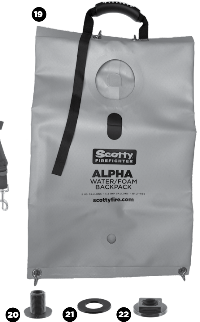
11 F-HARNESS4002A 19 F-CONT5GBAGA 12 F-LID4CLOSEDBLK 20 F-FLANGE34NYL 13 S-ORING241D70 21 F-GSKT34FLANGE 14 F-SCRNRETRNG 22 F-FLANGENUT34 15 F-SCRNFILFLNG4 16 F-FLANGENUT4 17 F-FLANGERING4 18 F-FLANGEFIL4